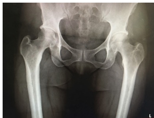
Figure 1 AP radiograph of the patient's pelvis and hips.

This case report documents the development of exogenous steroid-induced hypoadrenalism in a PLWH caused by a drug–drug interaction (DDI) between the CYP3A inhibitor cobicistat and